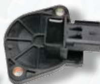
Chrysler Camshaft Sensor CSS1600