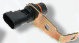
GM Crankshaft Sensor CSS123