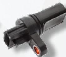
Nissan Camshaft Sensor CSS1464