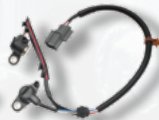
Honda Crankshaft Sensor CSS596