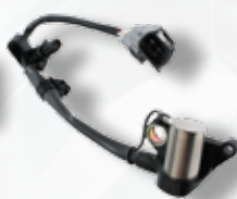
Toyota Crankshaft Sensor CSS839