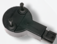
Ford Camshaft Sensor CSS149