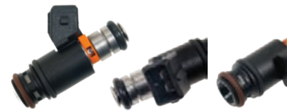
VW Exact Match Fuel Injector Intermotor FJ573