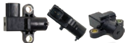
Nissan Exact Match Crankshaft Sensor Intermotor PC89