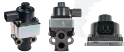
Mazda Exact Match EGR Valve Intermotor EGV660

Genuine Intermotor™ import parts fit right every time and that means No Comebacks.