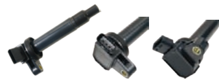
Toyota/Lexus Exact Match Coil-on-Plug Intermotor UF493