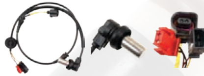
Audi Exact Match ABS Sensor Intermotor ALS429