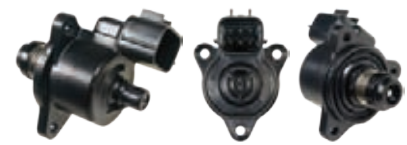
Mitsubishi Exact Match Idle Air Controls Intermotor AC254